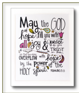
Women's Mid-South Great Banquet #81 Cover Art

You work on something for months, pray about it, meet with others and have some idea of what you hope it will be like but never could I have imagined it as it really happened. God was in charge and He does things we can't begin to fathom. It was.... WOW! Overwhelming. Spirit filled. Emotionally charged. Hilarious. Amazing. Phenomenal. Miraculous (2 sisters gave their lives to Christ... there was a small electrical fire that night in my cabin which only confirmed to me that the Enemy was furious about that) I am still OVERFLOWING with hope, love, joy, grace, and peace. I left for Pinecrest Thursday night and