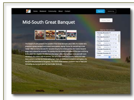
The website has a new look!

"In January 2017, the board is unveiling a new and improved web site which offers expanded functionality to further serve our community."